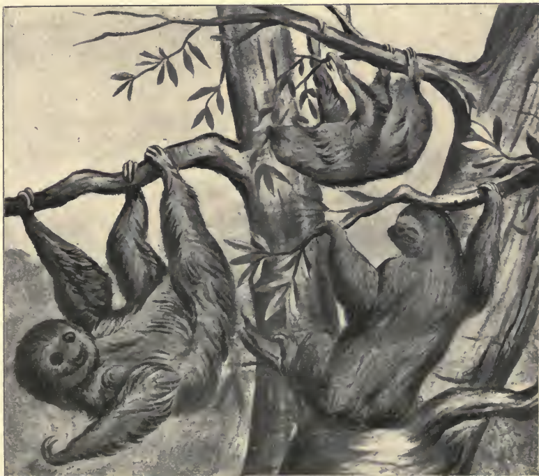
FIG. II. CHOLOEPUS HOFFMANNI. HOFFMANN'S SLOTH.